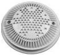
New Dome Drain Cover

Virginia Graeme Baker Pool & Spa Safety Act - A new federal law enacted in 2007 requires all public & semi-public pools to install new safety features to prevent suction-entrapment accidents. The new equipment was mandated to be installed as of December 20, 2008 or prior to re-opening seasonal pools in 2009. The equipment requirements consist of installing new domed drain covers on all pools. In a case where there is only a single main drain on the bottom of the pool or spa the operator must install a special safety vacuum release system either mechanical or electronic. This will cause the pump to automatically shut off if the device detects that the drain is completely covered & blocked as in the case of a swimmer being stuck on the bottom. The US Consumer Product Safety Commission (CPSC) is the enforcement agency; however, the Johnson County Health Department is advising and educating our pool operators in compliance concerns until such time as the rule is incorporated into State law.