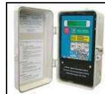
Electronic & Mechanical Safety Vacuum Release Systems