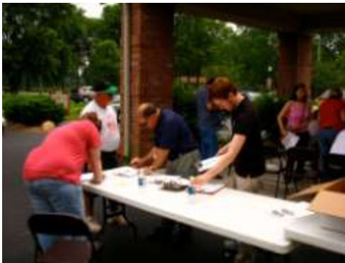
Edinburgh Clinic #2

The severe flooding occurred on 7 th of June. The Health Department office opened on the next business day in their temporary location in a drive through bank at 98 North Main Street in Franklin. The need and desire for tetanus clinics started immediately. On the 10 th of June, we held the first clinic in one of the most heavily hit areas. A total of seven clinics were held; two in Edinburgh, one in White River Township and four in the Franklin area. Department staff, our Medical Reserve Corps and other volunteers supported each of the clinics. Tetanus vaccine was brought in initially from other counties in the state and then a large supply arrived from the Center for Disease Control and Prevention.